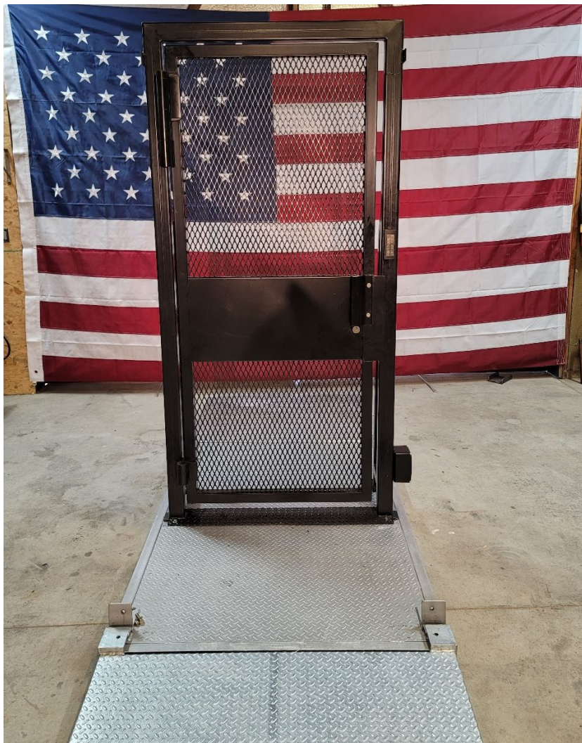
(older style ADA Gate shown)

Portable bases are available for all our ADA Gates with or without ramps. We can provide an ADA gate on a portable base or provide the ADA gate and the portable base separately; However the ADA gate will need to be installed on the base onsite.